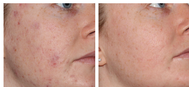
8 weeks post 5 treatments