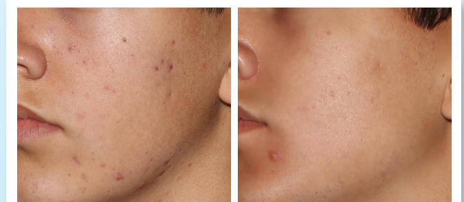
3.5 months post 9 treatments